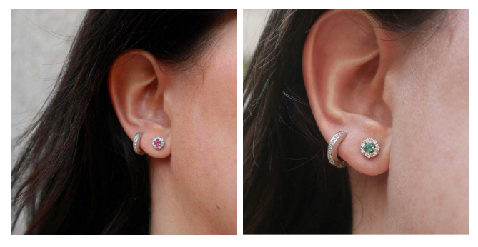
(a) Badly descripted accessory (b) Descripted as "Orion emer-"Orion ruby earring". ald earring".

Fig. 3: Accessories badly described by the best model. Similar shape and material.