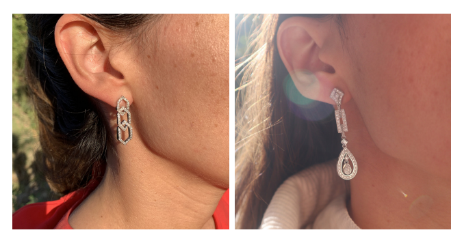
(a) Badly descripted accessory (b) Descripted as "Taurus white "Colette diamond earring". gold, diamonds earring".

Finally, a web page interface has been also created using the best image captioning developed models. This interface allows the user to upload an accessory image to generate a