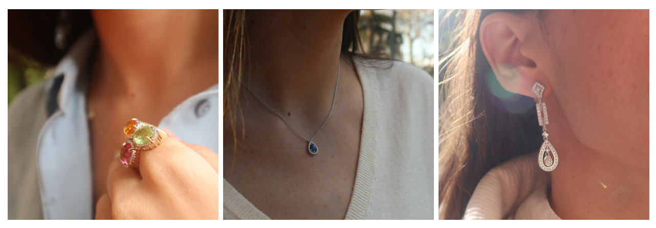
(a) Skye yellow gold and oval stones ring.