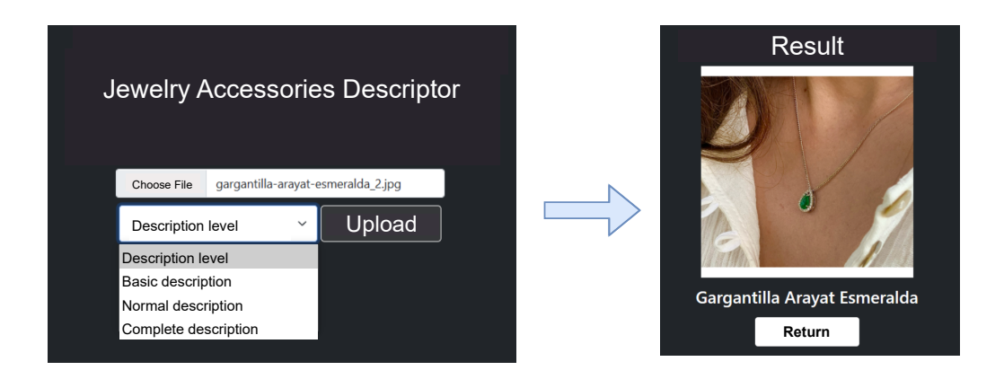
Fig. 5: Web page interface for accessory image captioning. Description for a necklace input image.

Bio-Medico di Roma. This PhD is also been performed in cotutoring with the University of Córdoba.