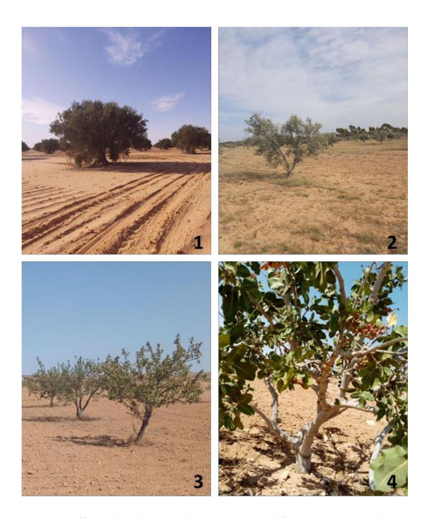
Figure 2. Different land uses in the experimental farm: Centenary olive grove, young olive grove, almond tree, and pistachio tree. (1): Centenary olive grove—old cultivated > 100 years; (2): young olive grove—newly cultivated < 12 years; (3): almond tree—newly cultivated < 12 years; (4): pistachio tree—newly cultivated < 12 years.

All soil samples were taken at the same time (synchronic approach) under different management practices at known durations from an initial reference state, and the SOCS was compared under this initial reference state [53].