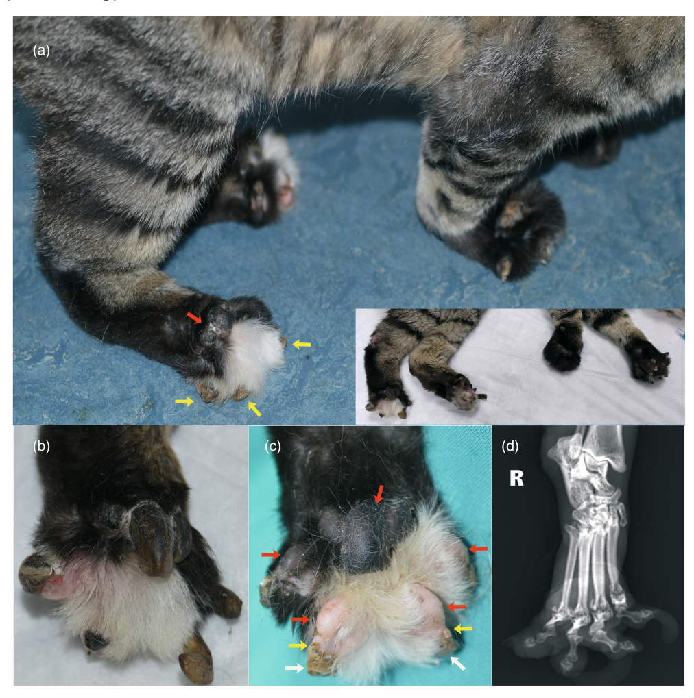
FIGURE 1 Paw pad duplication; cat. (a) In standing position one month after first examination. Dorsally duplicated central paw pads are visible (red arrows), as well as the plantigrade stance in all four limbs. Some of the ectopic digital pads are covered with newly formed hyperkeratotic material (yellow arrows). Inset, cat sedated and in lateral left recumbence at the first examination; the right limbs show the duplicated paw pads while the left limbs show the ventral paw pads. (b) Dorsal aspect of the right hind limb paw; duplicated paw pads are covered by large cutaneous horns that resemble dystrophic nails; the lack of normal digital flexion gives the paws a palmipede look. (c) Plantar aspect of the same paw one month after first examination. Central and digital paw pad skin within normal limits (red arrows) while duplicated dorsal paw pads are covered by newly formed keratotic material (white arrows). The tips of the rudimentary nails are visible (yellow arrows). (d) Radiograph of right hind limb showing subluxation of all interphalangeal joints.

interphalangeal joints showed subluxation with hyperextension more severe in the proximal interphalangeal joints (Figure 1d). Forelimbs showed humeroradial joint luxation and carpal bone malalignment, and the carpal accessory bone was absent in the left forelimb. Hind limbs showed the collapse of the central tarsal bone and distal tarsal bones I, II and III that caused an oblique position of calcaneus bones and lateral deviation of the paws (Figure 1d).