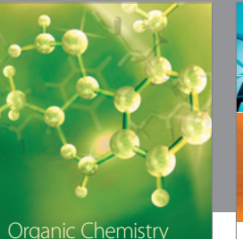
Organic Chemistry International