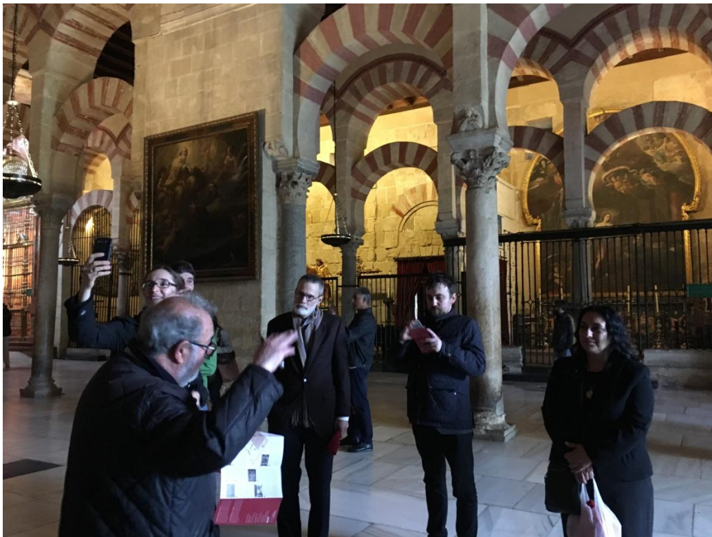
Some participants at the Mosque