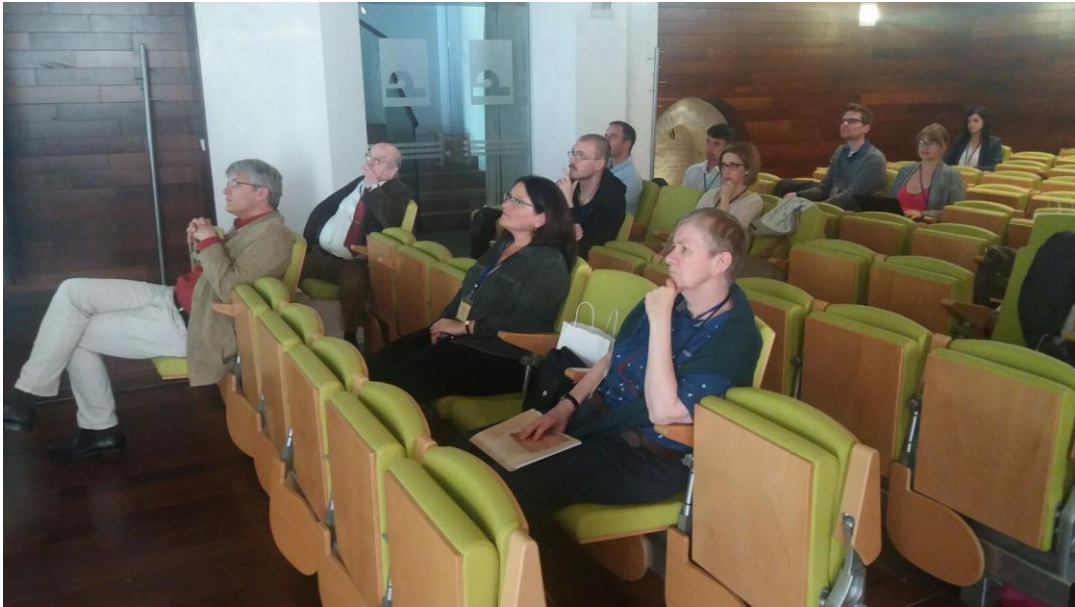
The audience mostly composed of participants attending the conference