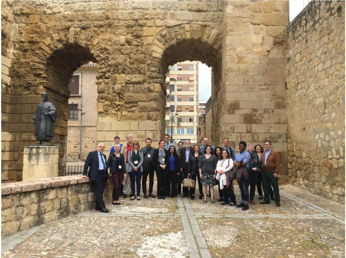
Participants at the base of the Ibn Hazm statue