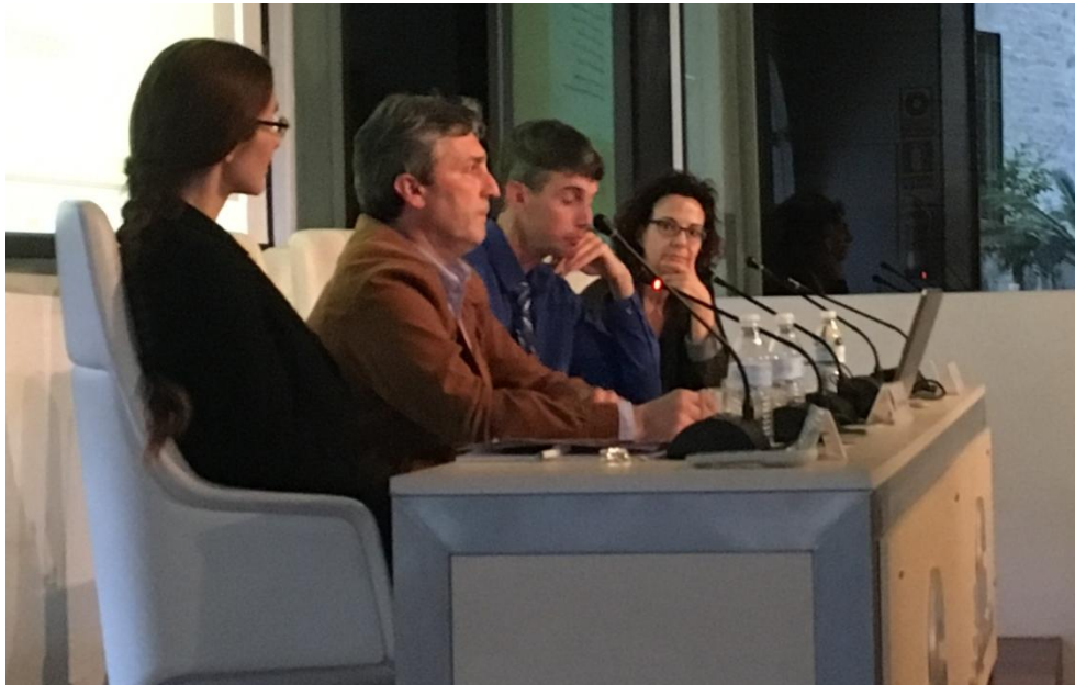
Discussion after a session