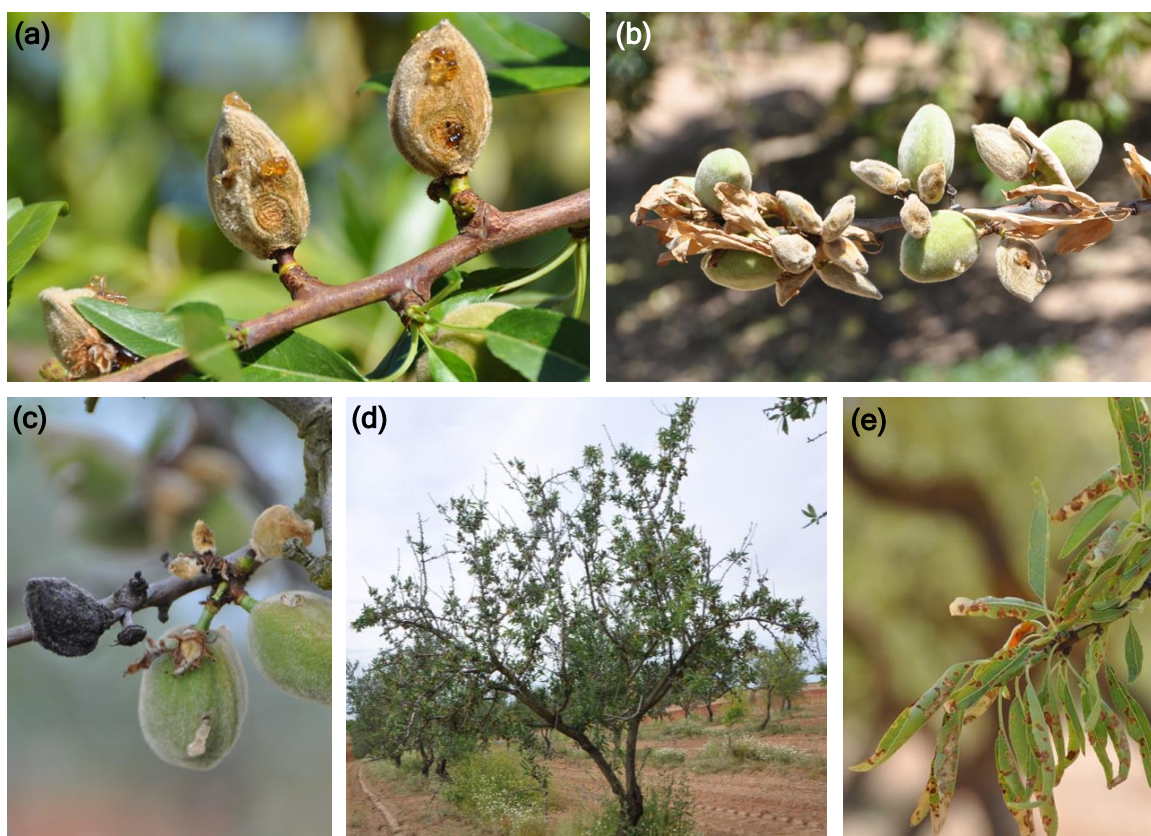
Figure 1. Characteristic symptoms of almond anthracnose caused by Colletotrichum spp. (a) depressed, sunken, round and orange lesions on green almonds; (b) branch with mummified fruits and necrotic leaves; (c) mummified fruits from infections caused the previous year and remaining in the tree canopy; (d) defoliation and dieback of shoots and branches as a consequence of the toxins produced by the pathogen; (e) necrotic irregular lesions in the tips and margins of the leaves [9].