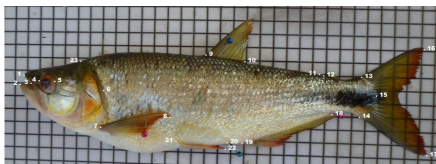
Figure 2. Locations of 23 anatomical landmark points showed in the left view of the Brycon dentex . Landmark points: 1: highest cranial point of the upper pre-maxilla; 2: highest cranial point of the lower pre-maxilla; 3: commissure of the mouth; 4: anterior edge of the eye; 5: posterior edge of the eye; 6: end of the operculum; 7: origin of the pectoral fin; 8: end of the pectoral fin radius; 9: origin of the first dorsal fin; 10: end of the dorsal fin; 11: origin of the second dorsal fin; 12: end of the second dorsal fin; 13: dorsal origin of the caudal fin; 14: ventral origin of the caudal fin; 15: highest cranial point of the caudal peduncle; 16: highest caudal point in the superior part of the caudal peduncle; 17: highest caudal point in the inferior part of the caudal peduncle; 18: end of the anal fin; 19: origin of the anal fin; 20: anal opening; 21: origin of the pelvic fin; 22: end of the pelvic fin radius; 23: nape, highest caudal point of the head.