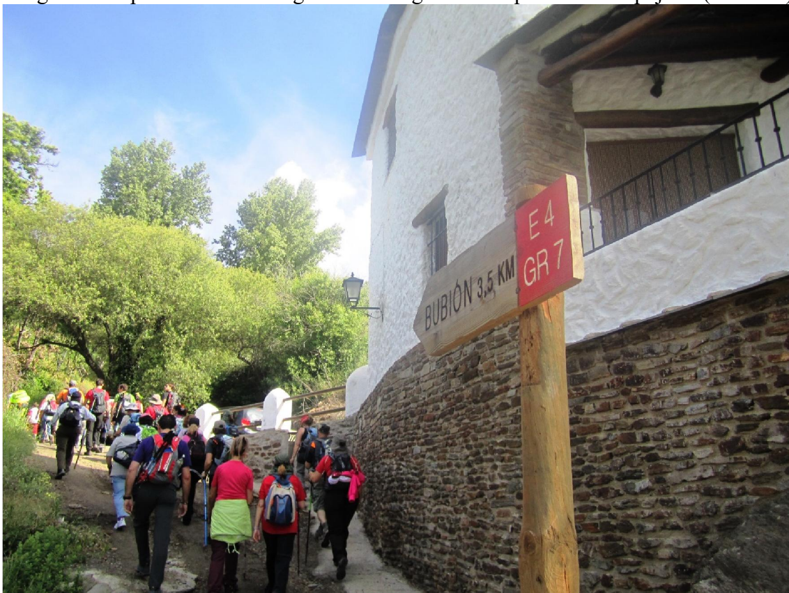
Image 1. Group of hikers crossing a town along a marked path in the Alpujarra (Granada)

• The multiplying effect of economic activities derived from the recovery, maintenance, supervision, reappraisal and the promotion of new uses of public paths could, in turn, lead to a certain fixation of the population in the region. Previous studies have shown that after becoming the spearhead of new economic activities linked to the promotion of sports and tourism, some municipalities later become population centres (Moscoso-Sánchez, 2003; Moscoso-Sánchez, 2010). There is evidence that the local economies in various populations in Andalusia are now maintained by the activities surrounding public rights of way. This is the case of villages in Sierra Nevada and the Alpujarras (Granada), the Sierras of Cazorla, Segura and Las Villas (Jaén), the Sierra of Grazalema (Cádiz), the region of La Axarquía (Málaga), the Sierra of las Subbéticas Cordobesas (Córdoba), the Sierra Norte of Sevilla (Seville) and the Sierra of Aracena (Huelva).