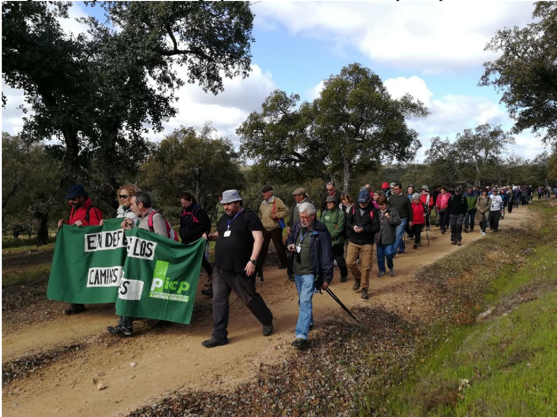
Image 2. Group of hikers during a protest march in defense of public paths

• And lastly, small and medium-sized farmers and livestock breeders and, in particular, environmental associations, citizens' platforms for the defence of public roads, sports associations and federations active in hiking, mountain biking and horse riding, cultural and pilgrimage associations, as well as other scattered groups in defence of public assets, are organising themselves —generally through citizens' platforms— to demand change through applying political pressure. Their actions include rallies in front of town halls or other symbolic places (they have even performed actions in the European Parliament) and via weekly mass rallies on public rural paths that have been blocked or usurped by private individuals.