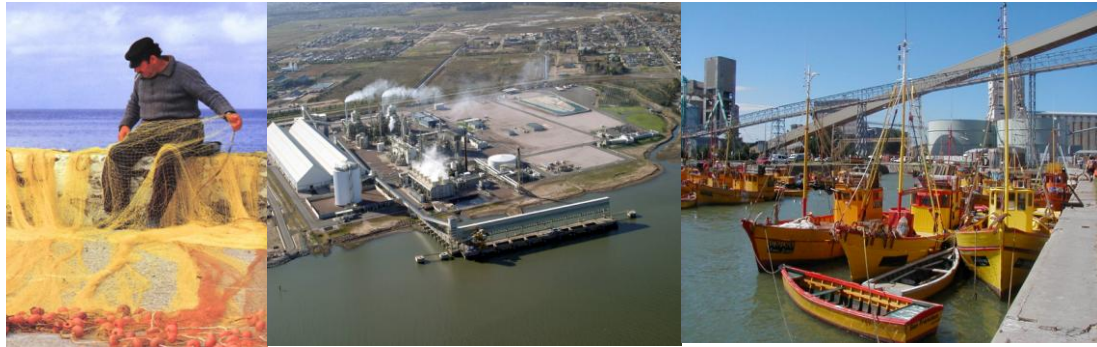
Figure 4: Artisanal Fishery and Petrochemical economic activities coexisting in the Ingeniero White Port

Usually, the later two activities above mentioned belong to the informal sector of the economy, with the consequent repercussions over social conditions. In particular, harvesting of shrimps and prawns constitutes the core of the informal labor market and involves, directly or indirectly, a lot of women and children working in related activities.