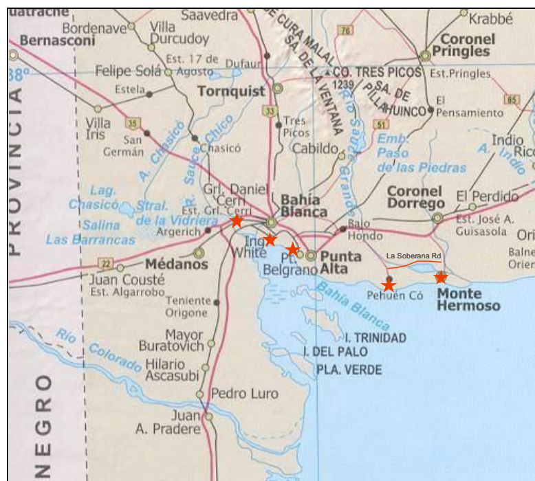
Figure 3: Administrative division of the area

As we stated above, the Monte Hermoso-Bahia Blanca Estuary region (Fig. 1) is located on the southwestern coast of the Buenos Aires Province (Argentina) along an E-W stretch about 100 km in length. The administrative division defines three different municipalities in the area (Fig. 3). From west to east along the coast and considering only the cities under study, the Bahía Blanca is the largest one and includes the local communities of General Daniel Cerri and Ingeniero White. Villa del Mar and Pehuén Co belong to the municipality of Coronel Rosales, whose capital is Punta Alta. Although Punta Alta is not a coastal city, there is a near port named Rosales Port which is part of the port system of the estuary. On the other hand and continuing along the coastline to the east, it is found Monte Hermoso, city which constitutes a municipality by itself.