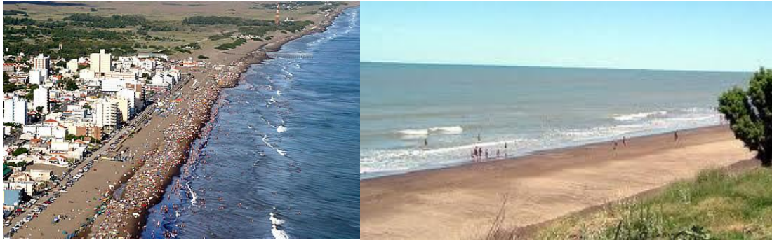
Figure 5. Touristic activities in Monte Hermoso and Pehuén Co beaches

Nevertheless, some differences between both localities in the exploitation of tourism can be stressed (Fig. 5). The profile of Monte Hermoso has been changing during the last year; following the pattern of large touristic cities (they are currently increasing the leisure supply for tourists). However, Contrarily, Pehuén Co still remains as a familiar, near rustic and short time touristic place. Thus, as expressed in surveys conducted by the Office of Tourism of Coronel Rosales (see 2.2.1.1) the main motivation of people choosing this destination is pursuing peace and nature, away from the noise and cement. Furthermore, people who choose Pehuén Co as a destination for rest mostly attend only by the day, usually Saturday or Sunday coming from the close city of Bahia Blanca. Predominantly visitors of this town are people between 26 and 40 years old, with medium to high level of education, traveling in couples or family groups (4 and 8 people).