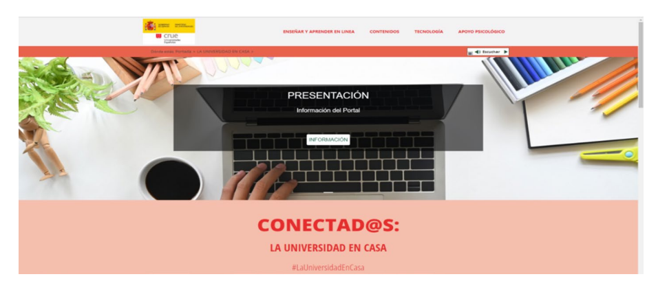
Fig. 1 Plataforma Conect@s

Discussions in forums and chats employed in subjects taught online at university are full of expressions of gratitude from the students, who are most grateful for the efforts by the teachers to try to maintain a certain level of education, yet they have also reflected, in those small informal conversations, that the system has been saturated with the use of tools that they did not use before this situation and that, in some cases, they did not consider relevant. In some other cases, tools were used which students did not even know how to use (Maz et al., 2012; AUTHOR). This shows that the results from some research studies