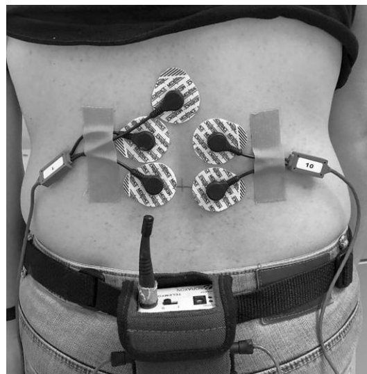
Figure 1. Electrodes placement.

Participants were instructed to move from a standing position to full frontal flexion in a gentle manner for 10 s. Full flexion was maintained for 5 s, followed by a return to the vertical position for another 10 s. After a rest of 5 s, the complete movement was repeated. Two cycles were recorded to calculate variability between measurements.