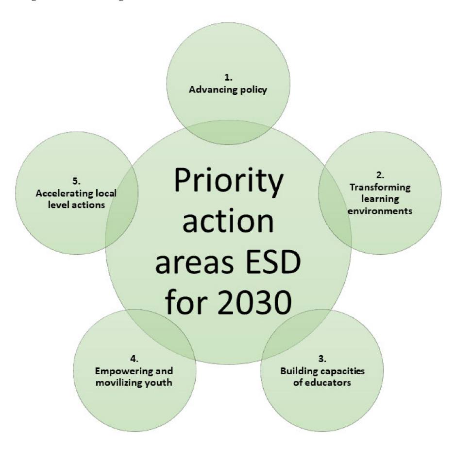
Figure 1. UNESCO's Priority action areas of ESD for 2030 framework.

The United Nations Educational, Scientific and Cultural Organisation (UNESCO) published in 2020 a document entitled 'Education for Sustainable Development: A Roadmap' [33], which presents five priority action areas in which the actors involved are encouraged to design activities (Figure 1).