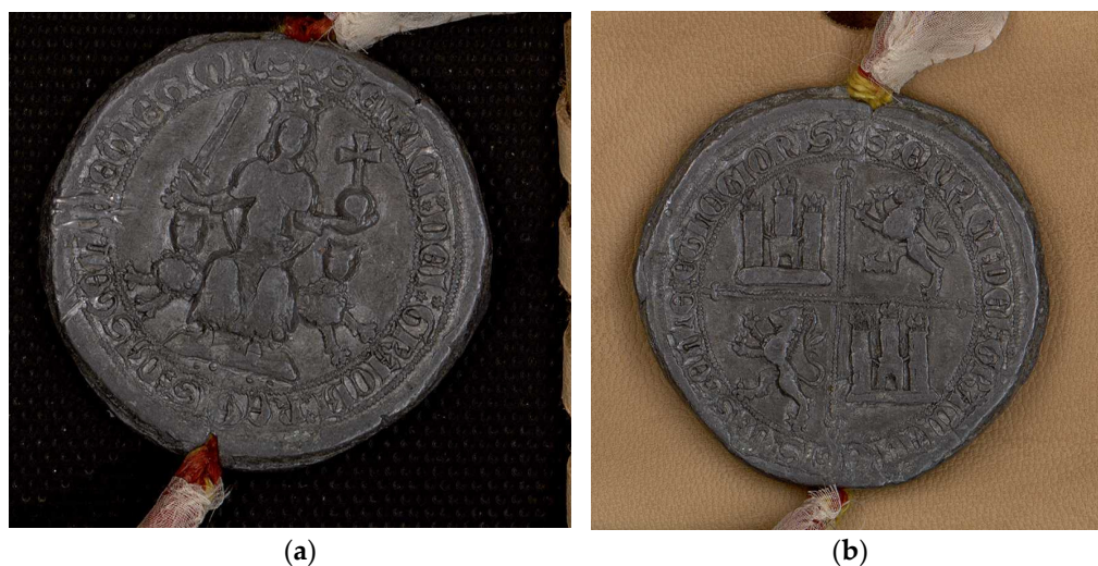
Figure 3. Seal of Henry II. Impression on lead. 1371. Archivo Municipal de Toledo. (a) Front; (b) Back (The original document dates from 16 September, 1371, and is stored in the Archivo Municipal of Toledo (Spain), Secret Archive, Drawer 10, File 6, Number 6, Piece 3. See [28]).

a majestic manner, seated upon two lions alluding to the Solomonic throne in order to manifest the king's authority to impart justice (Figure 3). His claim to succession was, thus, reaffirmed, as in the imago maiestatis the iura regalia are represented; that is, the most common symbols of power: a sword in his right hand, a crown and orb in his left, transmitting a sense of continuity along the dynastic line, and of legitimacy. The presence of the cross on the globe and the crown reiterates the idea of the king as Christ's envoy, while the fleur-de-lis topping the pommel of the sword reveals a French influence. On the reverse appear the heraldic arms of Castile and León. A fleur-de-lis cross creates the checkered pattern in which the castles and crowned rampant lions are alternately inserted. On the borders of both sides, we read the inscription: "† S : ENRICI : DEI : GRACIA : REGIS : CASTELLE : ET : LEGIONIS" [27].