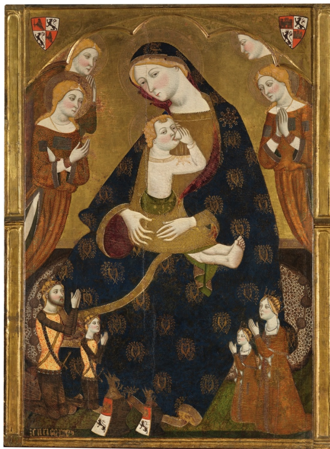
Figure 1. The Virgin of Tobed with donors Henry II of Castile, his wife Juana Manuel, and two of their children. Painting. 1367–1369/1375. Attributed to Jaume Serra. Prado Museum.

1375, by this year, neither of the two infantes had yet married, the scholar noting that, in addition, they are still almost childlike in appearance (Figure 1) [15] (pp. 89–118).