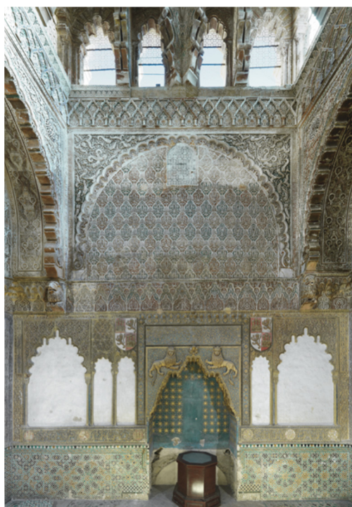
Figure 2. Royal Chapel’s East wall. 1371. Mosque/Cathedral of Córdoba.

On the east wall of the chapel, there is a niche framed by a pavilion arch full of muqarnas (honeycomb vaulting) and polychrome with gold leaf. The niche’s background is blue, dotted with golden stars, and in the center, there must have been an image, originally on the altar table. This image was replaced by a sculpture of Ferdinand III, the Saint, canonized in 1671. The original figure may have also been that of this king, as the alcove is flanked by the shields of Castile and León, with two superb lions rampant crowned in relief guarding it. In addition, the plasterwork frieze that tops the tiled plinth features, alternately, the emblems of Castile and León, along with the inscription ‘happiness’ in Kufic Arabic (Figure 2).