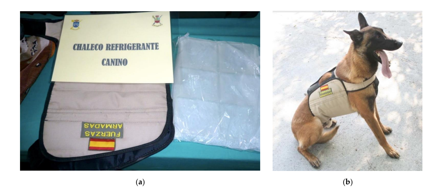
Figure 3. (a) Close-up of cooling vest (PCM-CV) with cooling pads. (b) An MWD wearing a PCM-CV. They require prior cooling (or freezing) of the pads.