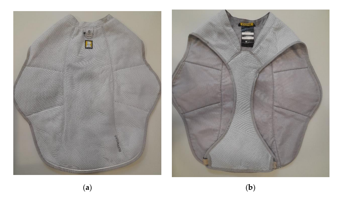
Figure 4. Detail of the outside ( a ) and inside ( b ) of the evaporative cooling vest Swamp Cooler<sup>TM</sup> used in this clinical study. It consists of three layers to absorb water and facilitate evaporation. Requires wetting with clean water before use.

The following figure (Figure 4) shows the second model of cooling gear, used in this study, based on evaporation (Swamp Cooler © RUFFWEAR , 2843 NW, Bend, OR, USA. This cooling vest uses three layers of cloth to absorb water and facilitate evaporation. The three-layer consist of air mesh fabric made of polyester ripstop, Shinwon royal felt to hold the water, and a 100% polyester mesh lining that is in contact with the dog. It is thanks to evaporation that the dog's surface temperature cools down [13]. This vest is wrapped around the dog and acts on the entire trunk, both in the dorsal and central areas and requires 2–5 min for activation. The weight of this cooling vest for dogs (size XL) is 380 g (0.8 Lbs.) when dry, rising to 780 g (1.7 Lbs.) when moistened for use.