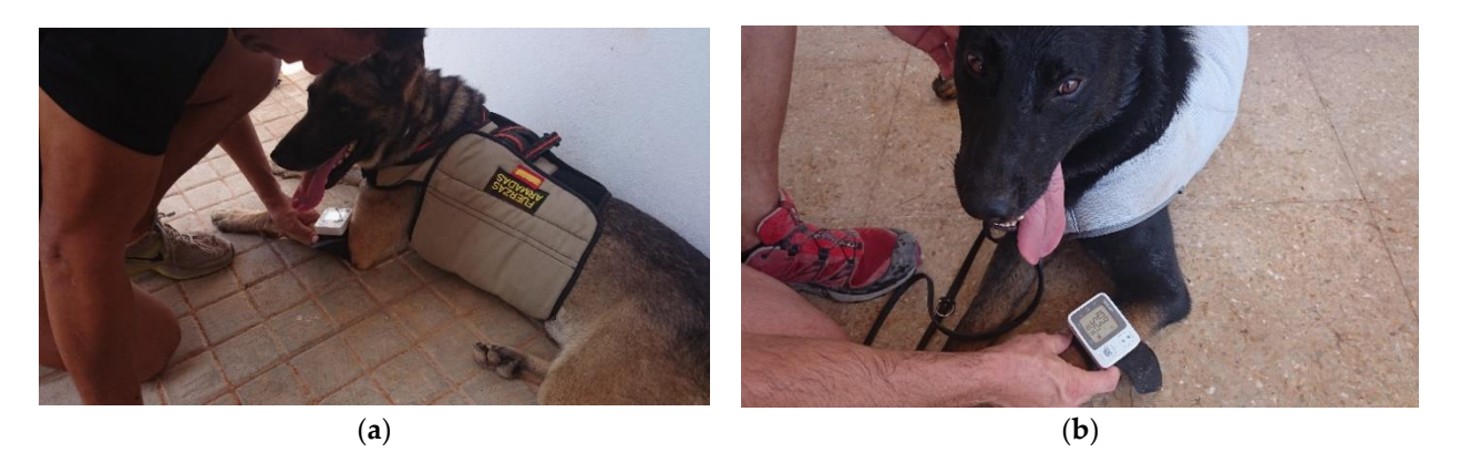
Figure 2. Non-invasive systemic blood pressure measurement in dogs immediately after exercise ( a ) with PCM-Cooling vest (by contact with cold tablets) and ( b ) evaporation cooling vest.

Systemic arterial pressure was determined non-invasively, with an oscillometric method, using an OMRON© HEALTHCARE Co., Ltd. (Muko, Kyoto, Japan), model RS3 (HEM-6130-E) digital wrist blood pressure monitor (Figure 2). This device supports a pressure range of 0 to 299 mmHg, with a pressure accuracy of \pm 3 mmHg. The approximate cuff circumference of this pressure monitor is 13.5 to 21.5 cm, and it has an operating temperature and humidity of +10 to +40 °C and 30 to 85% RH, respectively [12]. Pulse rate (PR) was obtained manually, in the femoral artery. These devices were acquired for the exclusive use of this clinical study, for which a prior control of the sphygmomanometers was carried out and users' guidelines were given to the canine handlers and assistants responsible for taking each measurement. In all cases, the left forelimb was used, immediately next to the elbow, which is the area of best adaptation to the size of the sphygmomanometer cuff.