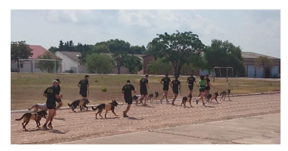
Figure 1. Image of one of the days of the clinical study. The circuit used in this clinical study was the one these dogs usually performed, on land, with a total duration of 20 min and at an average speed of 10 km/h, reaching 3.43 km.

The field test consisted of a routine training exercise for these MWDs and consisted of 20 min of running at a pace of 10 km/h, together with their canine guides (Figure 1), in the usual facilities of this k-9 unit (Valencia, Spain). Each handler recorded the total activity (route, running pace and distance) using a Garmin<sup>®</sup> Forerunner 45 GPS watch (Garmin International, Olathe, KS, USA & Garmin Corporation, New Taipei City 221, Taiwan, R.O.C.) with heart rate monitor over the three days of the study. Environmental conditions of temperature and relative humidity were recorded using a wireless device (Gesa<sup>®</sup> Weather Logic Station, Urduliz (Vizcaya), España), which was placed at the outdoor exercise site each day of the study.