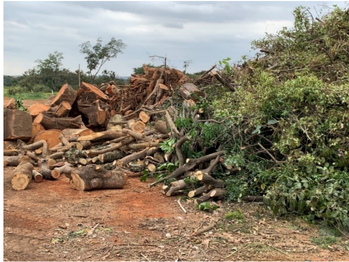
Figure 3: Green urban residues received at the Compost Plant.

The grinding is performed until wood chips maximum of 150 mm size are obtained, so to allow air circulation inside the pile. The material needs to be well mixed with the objective to maintain an equal C/N ratio and increase the contact between the particles for the beginning of the composting process. The grinded material will be mixed with the dehydrated sewage mud. The wood grinder is a “HAAS / BRUNO INDUSTRIAL”, model TYRON 2000 XL, low rotation with two axes, self-propelled with tracks. Its main features: power 400 HP, width between axes: 2,000mm, axes diameter: 700mm, dimensions: L – 10.7 m; W – 2.55 m; H – 3.15 m, rotation until 41 rpm, and granulometry until 150 mm.