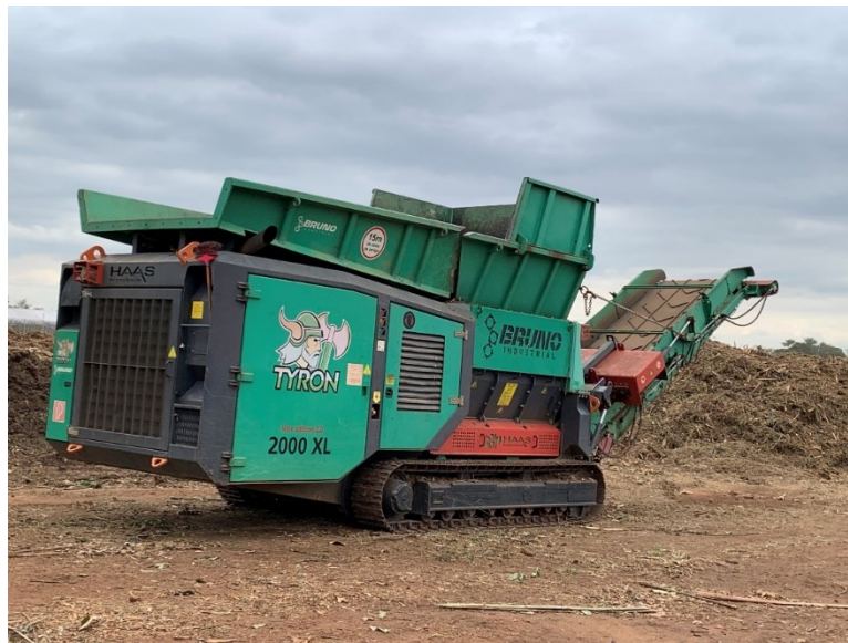
Figure 4: The HAAS / BRUNO INDUSTRIAL", model TYRON 2000 XL wood grinder.

The grinded material is then transported using wheel-loaders and trucks to make the windrows. The quantity handled daily is around 45 tons of green material and 33 tons of dehydrated sewage mud, totaling around 78 tons/day.