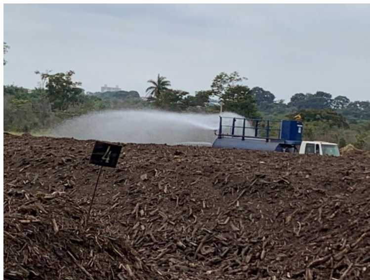
Figure 7: the compost windrows being humidified.

Besides aeration, there is a need for a daily and systematic humidification. Tank truck of 10m 3 sprays water over the compost windrows to maintain the moisture. For the windrows, the humidification process is necessary to optimize the biological processes.