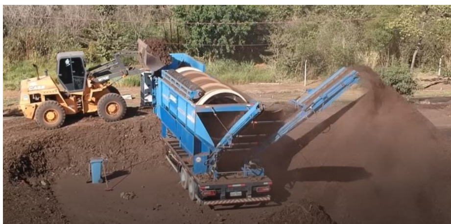
Figure 8: The compost screening operation.

The next step in generating a homogenous compost is the screening process in which are separated particles based on granulometry. The objective of this segregation is to eliminate larger fractions that could disturb the manipulation of organic material in its application. These larger fractions are recycled back in the beginning of process (grinding step) with the objective to activate the biological conditions, considering the material rich microorganism content. After the screening process is completed, the material will rest to gradually lose its heat until reaching ambient temperature. This thermal equilibrium is an indication that the organic compost will not cause any harm to its recipient, and the compost is then ready to be used/commercialized. The screen has a fast-replacing drums to handle materials with higher moisture content. This equipment is supplied by Bruno Industrial, model RODO PRB-06, with the following features: drum diameter 2,000 mm, length 6,000 mm, production capacity until 130m 3 /hour, rotary brush for cleaning.