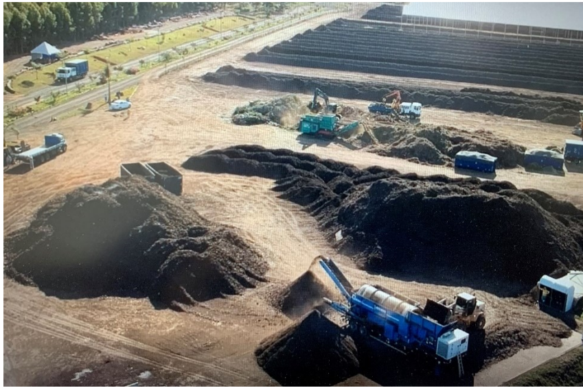
Figure 6: The Compost Plant aerial view.

Besides aeration, there is a need for a daily and systematic humidification. Tank truck of 10m 3 sprays water over the compost windrows to maintain the moisture. For the windrows, the humidification process is necessary to optimize the biological processes.