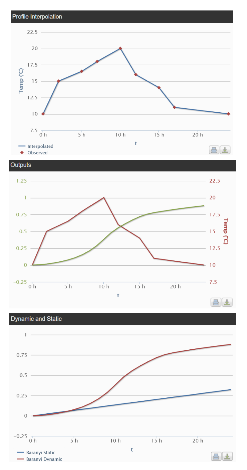
Figure 2. Predictions of S. enteritidis growth in egg yolk at dynamic temperatures obtained using the model of Gumudavelli [92] in MicroHibro. Top: representation of the dynamic temperature profile; middle: growth of S. enteritidis at dynamic temperatures; bottom: comparison of S. enteritidis growth in egg yolk under dynamic conditions and at a static temperature of 10 °C.