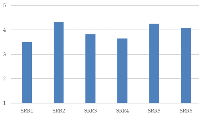
Figure 2. Values for situations in a relationship with risk of acts of violence. SRR = “Risk Situations in a Relationship”.

They considered that situations of greater risk of acts of gender-based violence or sexual harassment (Figure 2) may occur during the divorce/separation of a couple (M = 4.08; SD = 0.980) or afterwards (M = 4.01; SD = 1.049) and in trying to break up a boyfriend/girlfriend relationship (M = 4.34; SD = 0.866).