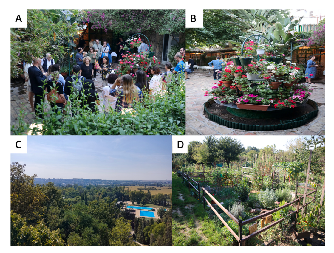
Fig. 2. Examples of green spaces in both cities. A) Traditional "patio" or courtyard in Córdoba (Spain): People use these spaces as social hubs. B) Using floral plants in pots is typical of patios in Córdoba (Spain). C) View of the green landscape in Nitra (Slovakia). D) Allotments in Hidepark, Nitra (Slovakia).

18 or older) consented to participate in the study. Data collection occurred in November 2021. Questionnaires were offered in the native language of each location (Spanish for Córdoba, and Slovak for Nitra). Since the questionnaires were utilized in a broader study, they encompassed various topics such as demographics, interactions with animals, perceptions of green spaces and public areas within the city, behavioural shifts during the COVID-19 pandemic, and social cohesion. The questionnaires comprised 63 questions, organized into five sections. However, for the purposes of this study, we selectively extracted variables pertinent to our research questions, which included sociodemographic information (age, gender, highest educational attainment, and employment status), as well as measures of mental well-being, mental health, and perceptions of green spaces.