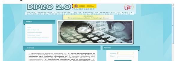
Figure 1: DIPRO 2.0 environment portal

For students who were attending in the academic year 2011-2012 that subject could access the contents of the thematic "Web Quest" were assigned a self to which assigned them a password, accessing the module via the platform DIPRO 2.0 (see fig. 1).