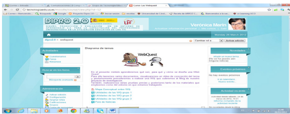
Figure 2: Web Quest module on the DIPRO 2.0 platform.

Once there, the students entered the platform could only access the specific Web Quest module (see fig. 2).