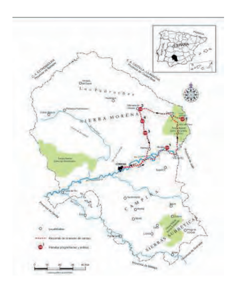
Location of the route in the context of the province of Cordoba