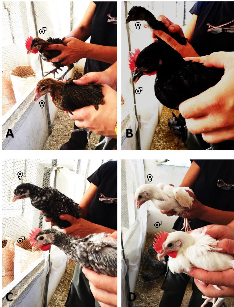
Figure 3. Sex dimorphism across Utrerana hen breed varieties at age 1.5 months with (A) showing a Utrerana partridge variety cockerel and pullet, (B) a Utrerana black variety cockerel and pullet, (C) a Utrerana franciscan variety cockerel and pullet, and (D) a Utrerana white variety cockerel and pullet.

Utrerana pullets and cockerels develop secondary sexual features at 6 weeks of age as shown in Figure 3, hence the real sex of the animals could be confirmed.