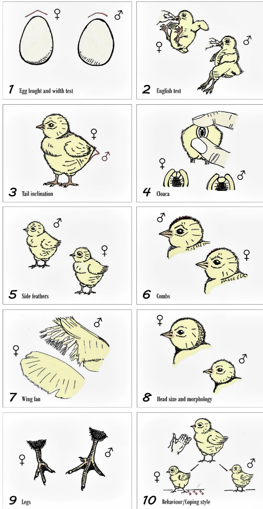
Figure 2. Sex assignment methods and criteria described in literature (Utrerana white variety was used as a reference).