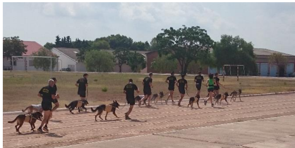
Figure 1. Image of one of the days of the clinical study. The circuit used in this clinical study was the one these dogs usually performed, on land, with a total duration of 20 min and at an average speed of 10 km/h, reaching 3.43 km.

The field test consisted of a routine training exercise for these MWDs and consisted of 20 min of running at a pace of 10 km/h, together with their canine guides (Figure 1), in the usual facilities of this k-9 unit (Valencia, Spain). Each handler recorded the total activity (route, running pace and distance) using a Garmin ® Forerunner 45 GPS watch (Garmin International, Olathe, KS, USA & Garmin Corporation, New Taipei City 221, Taiwan, R.O.C.) with heart rate monitor over the three days of the study. Environmental conditions of temperature and relative humidity were recorded using a wireless device (Gesa ® Weather Logic Station, Urduliz (Vizcaya), España), which was placed at the outdoor exercise site each day of the study.