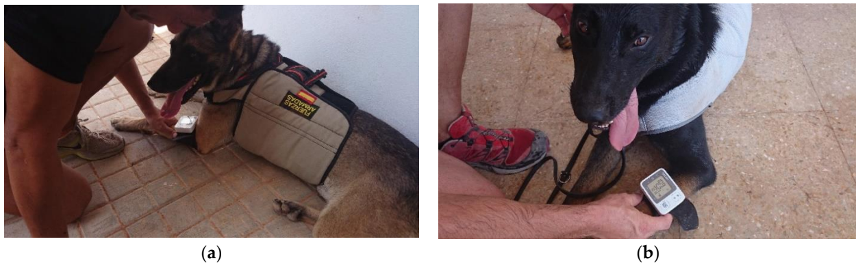
Figure 2. Non-invasive systemic blood pressure measurement in dogs immediately after exercise (a) with PCM-Cooling vest (by contact with cold tablets) and (b) evaporation cooling vest.

Systemic arterial pressure was determined non-invasively, with an oscillometric method, using an OMRON® HEALTHCARE Co., Ltd. (Muko, Kyoto, Japan), model RS3 (HEM-6130-E) digital wrist blood pressure monitor (Figure 2). This device supports a pressure range of 0 to 299 mmHg, with a pressure accuracy of \pm 3 mmHg. The approximate cuff circumference of this pressure monitor is 13.5 to 21.5 cm, and it has an operating temperature and humidity of +10 to +40 °C and 30 to 85% RH, respectively [12]. Pulse rate (PR) was obtained manually, in the femoral artery. These devices were acquired for the exclusive use of this clinical study, for which a prior control of the sphygmomanometers was carried out and users' guidelines were given to the canine handlers and assistants responsible for taking each measurement. In all cases, the left forelimb was used, immediately next to the elbow, which is the area of best adaptation to the size of the sphygmomanometer cuff.