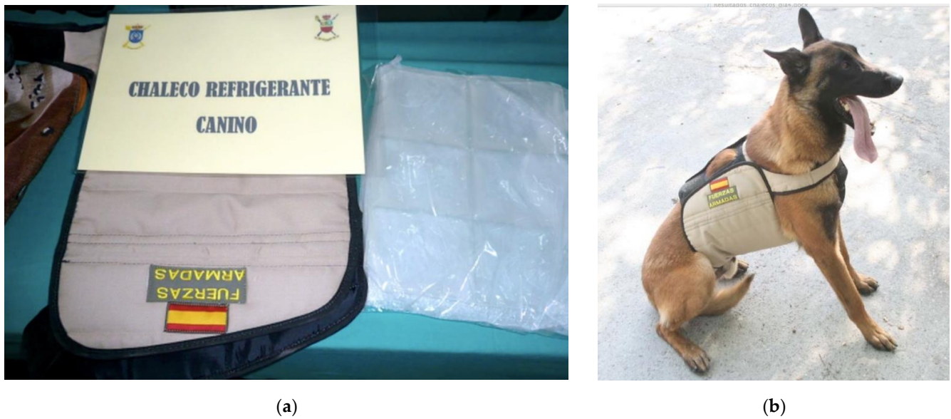
Figure 3. (a) Close-up of cooling vest (PCM-CV) with cooling pads. (b) An MWD wearing a PCM-CV. They require prior cooling (or freezing) of the pads.